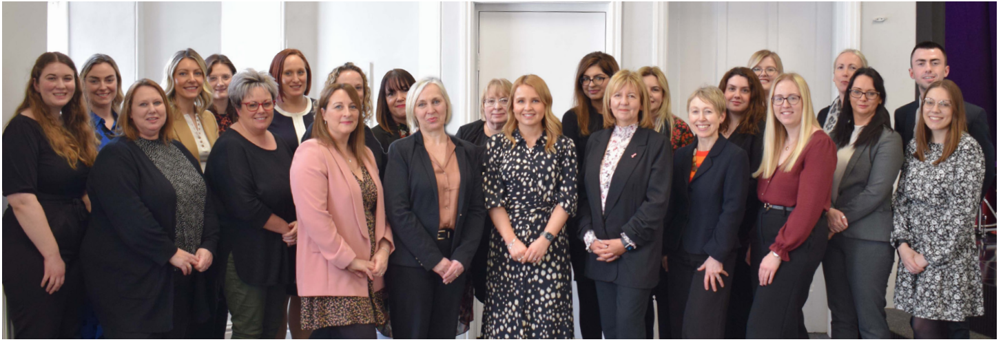
Sills & Betteridge Matrimonial Team