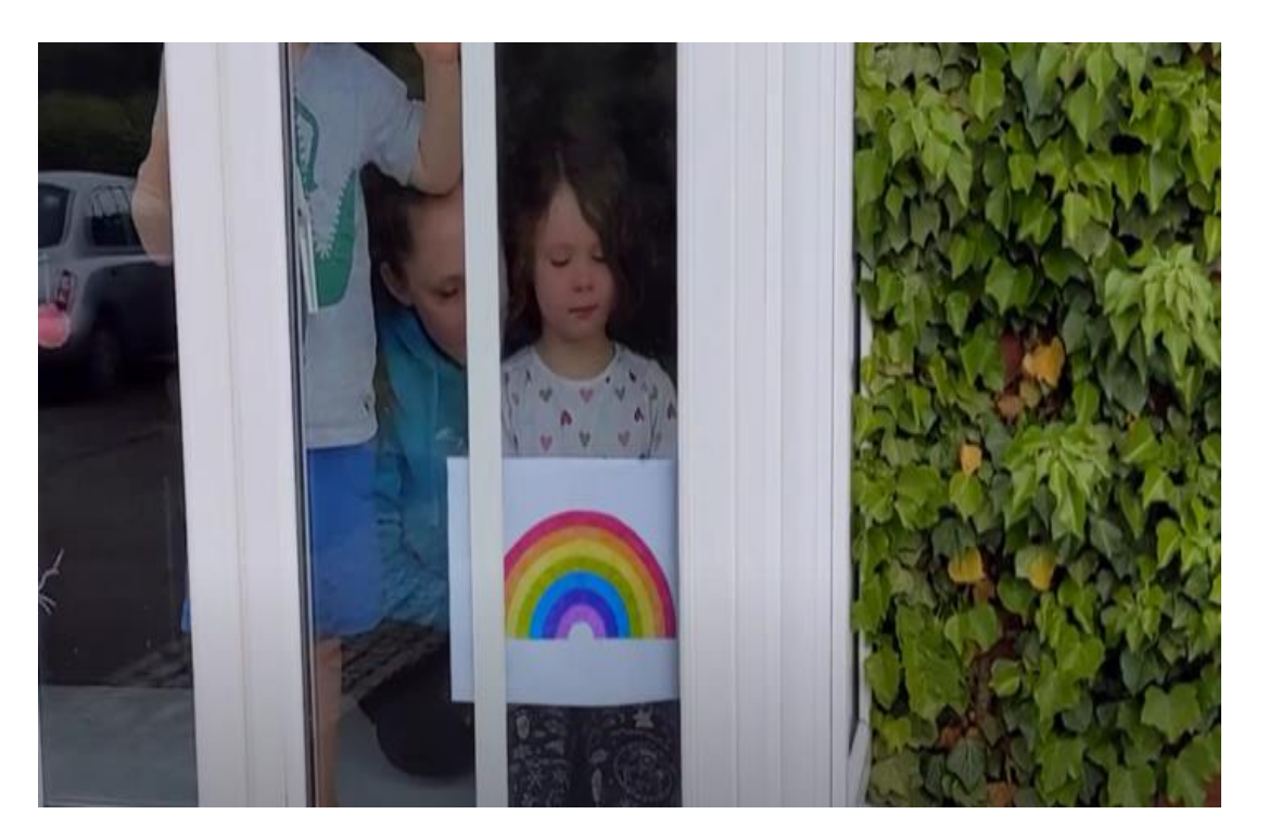
Warning: content could cause distress. Portrayed by actors

Please watch this short video produced by National Centre for Domestic Violence, it reminds us why protective orders and injunctions are important and can help protect someone being abused.